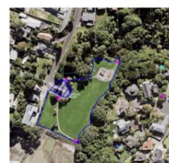
Lynfield Cove Beach Reserve area to close

The Lynfield Cove Beach Reserve and all access to Lynfield Cove Beach will be closed for one month as this is where the debris/trees/logs need to be wood chipped. The stream blockages can only be removed by a helicopter due to the steepness of the gully. There will be noise from the helicopter and the wood chipping, however this is not expected to be for more than a week. There will be signs put up at each of the reserve's six entries explaining why the reserve is being closed. The reserve will be reinstated on completion. Thank you for your patience while we carry out this work.